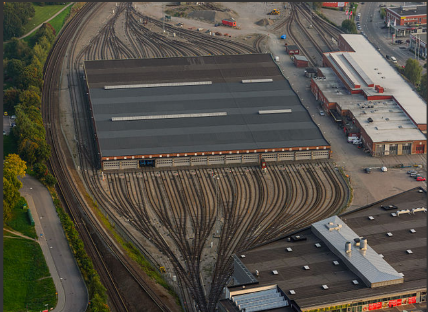
Vällingbydepån (the Vällingby Subway depot), Stockholm metro

Free eBook on Dispute Boards with new paid