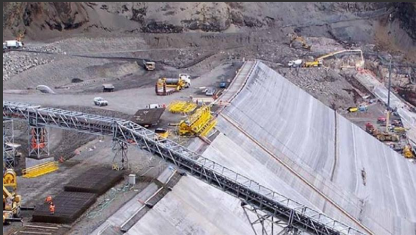
Iceland's Kárahnjúkar Electric Project

In a land known for volcanoes, glaciers and very few people, the Kárahnjúkar Electric Project has been Iceland's most ambitious infrastructure mega-project.