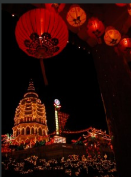
Kuala Lumpur, Malaysia

If you've never seen the marvel of the Petronas Towers in Kuala Lumpur, Malaysia in person, now is your chance! There will be a Claims Presentation Course in Malaysia's capital city on 19 September 2014. If you're interested in attending, contact Lori Fusello for more information.