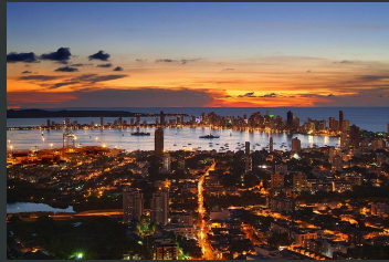
Cartagena, Colombia Panorama

Download a program brochure for more information on course content, or send us an email with your questions.