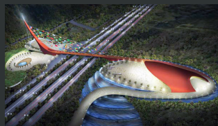
Design for new Abuja City Gate, Nigeria