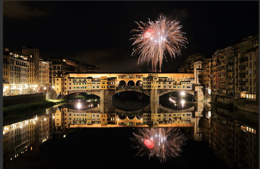
Fireworks over Ponte Vecchio, Florence Italy