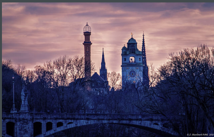
Munich, Winter Evening on the River Isar