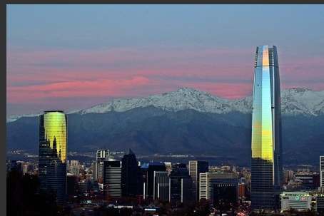
Torre Costanera in Santiago, Chile

In light of this month's focus on Latin America, the Project of the Month is Latin America's tallest building the Torre Costanera aka Gran Torre Costanera located in the Costanera Center in Santiago, Chile.